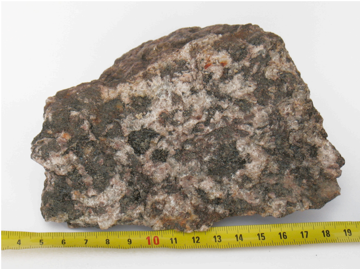
Picture 1 (IMG_3075.jpg): Sample from the stone jetty, shows stone from more distant site.