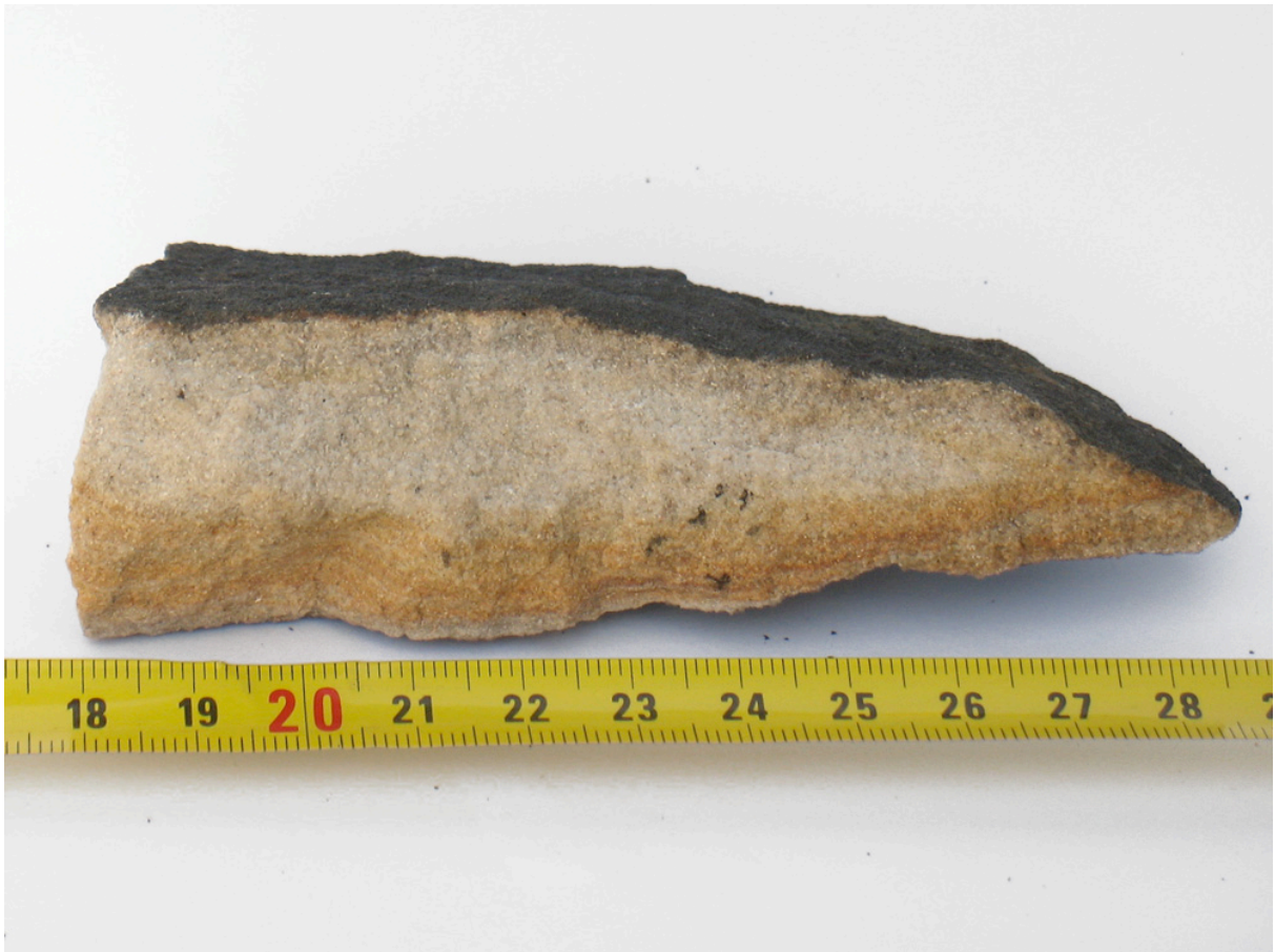
Picture 6 (IMG_3089.jpg): Sample from the stone jetty, unknown site of origin